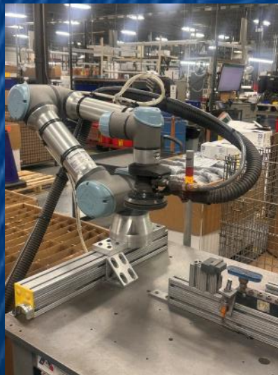
Mac — Sanding Cobot