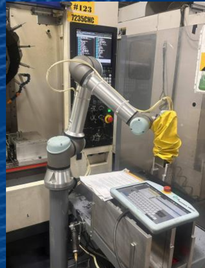
Jim — CNC Cobot