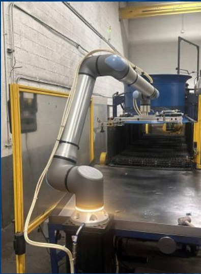
Charlie — Die Trim Cobot

CWM is embracing the future with the addition of new cobots to our production team! These high-tech helpers are working alongside our employees in die casting, CNC, and assembly, taking on repetitive and physically demanding tasks to improve efficiency and safety. By collaborating with our skilled workforce, these cobots are enhancing workflow and creating more opportunities for our team to focus on specialized tasks. Check out some pictures of our robotic coworkers — each with their own name and personality!