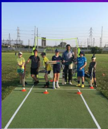
Batters Group Photo