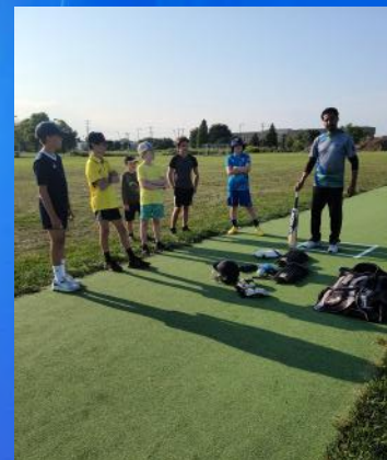
Cricket Gear - Demo