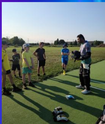
Batting Helmet - Demo