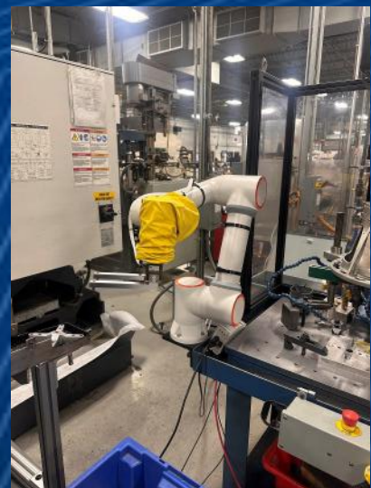
Frank — Machining Cobot