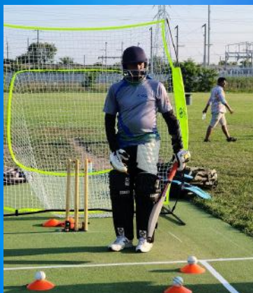
Batting Technique - Demo