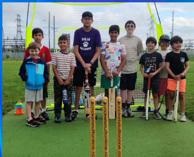
Kids Group Photo