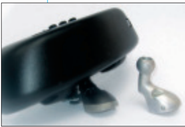
Mg die cast mirror support, with assembled and finished self-dimming mirror

A new Mg die cast support for the advanced Gentex self-dimming automotive mirror is being produced with all part trimming operations eliminated. CWM is