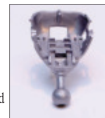
Al mirror support

An aluminum die cast model of the Gentex self-dimming automotive rearview mirror support won an award for Al die casting excellence based on its cast integrity and dimensional accuracy. The ball end of the support is held to a tolerance of +/-0.1 mm over long production runs, required to provide years of trouble-free operation in use through wide changes in temperature and humidity. Plastics could not meet the vibration requirements. ■