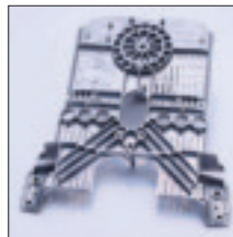
Al baseplate support

a 6 in. length across the structure's 8.5 in. center width restricted edge-to-edge metal flow. CWM employed Magmasoft simulation software for the optimum gating design.