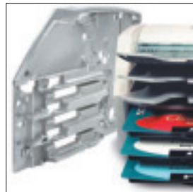
Mg imager side walls

assured cassette alignment, with wall flatness held as-cast to at or under 0.032 in. A proprietary system for direct injection into the die casting eliminated edge gating.