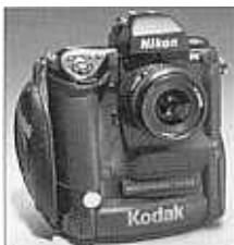
Superior shielding was one of the main reasons for selection of a die cast case for this digital camera.